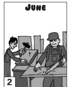
2 (at work)